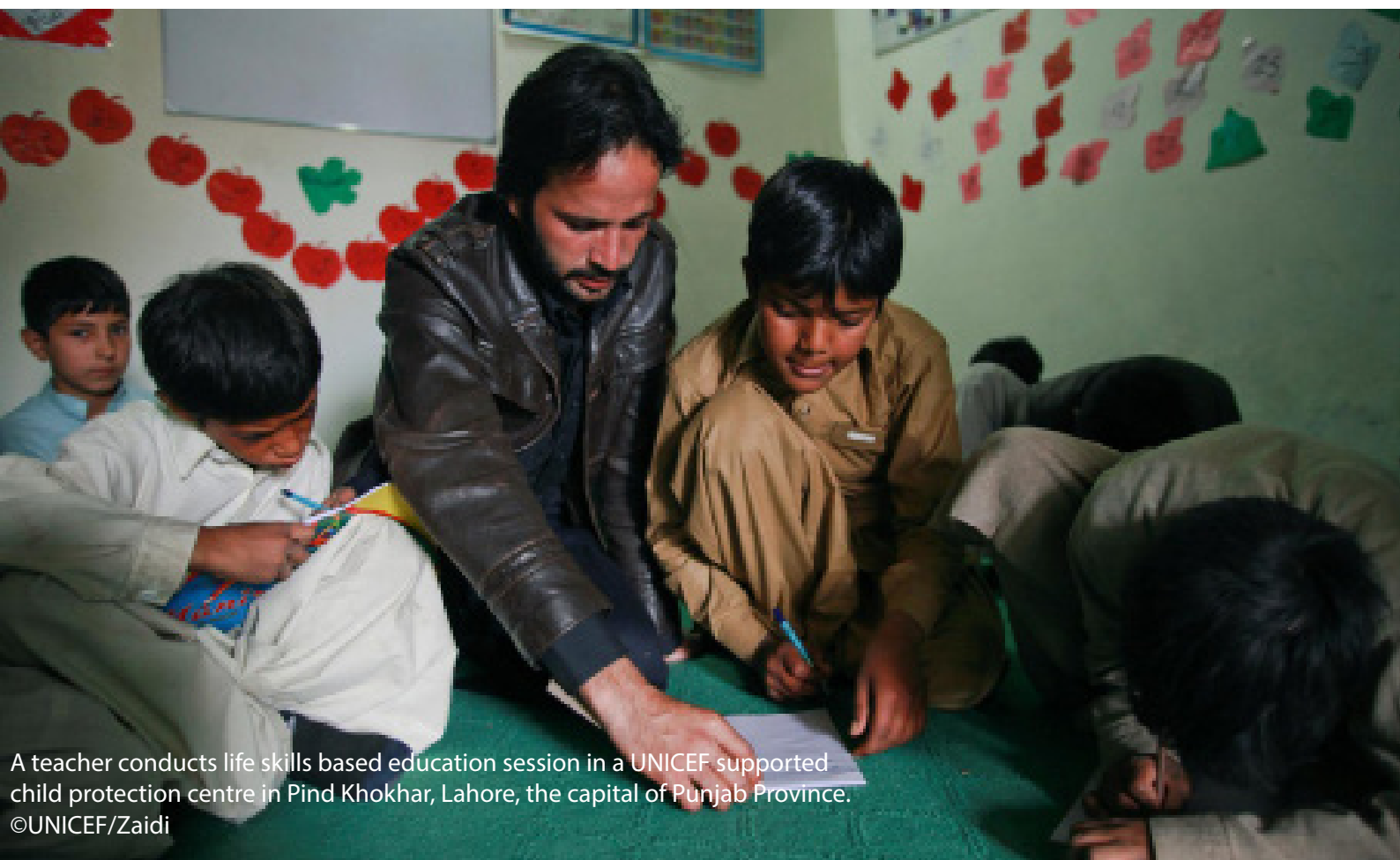
A teacher conducts life skills based education session in a UNICEF supported child protection centre in Pind Khokhar, Lahore, the capital of Punjab Province.

As discussed in RA1, the National Curriculum was revised in 2006. The revision was led by the Curriculum Wing of the Federal Ministry of Education, in consultation with the four Provincial Bureaus of Curriculum and a range of stakeholders. The National Curriculum 2006 (NC 2006) adopted a standards and benchmark approach with a focus on competencies, representing a shift from the content-based approach used in the Curriculum 2000.