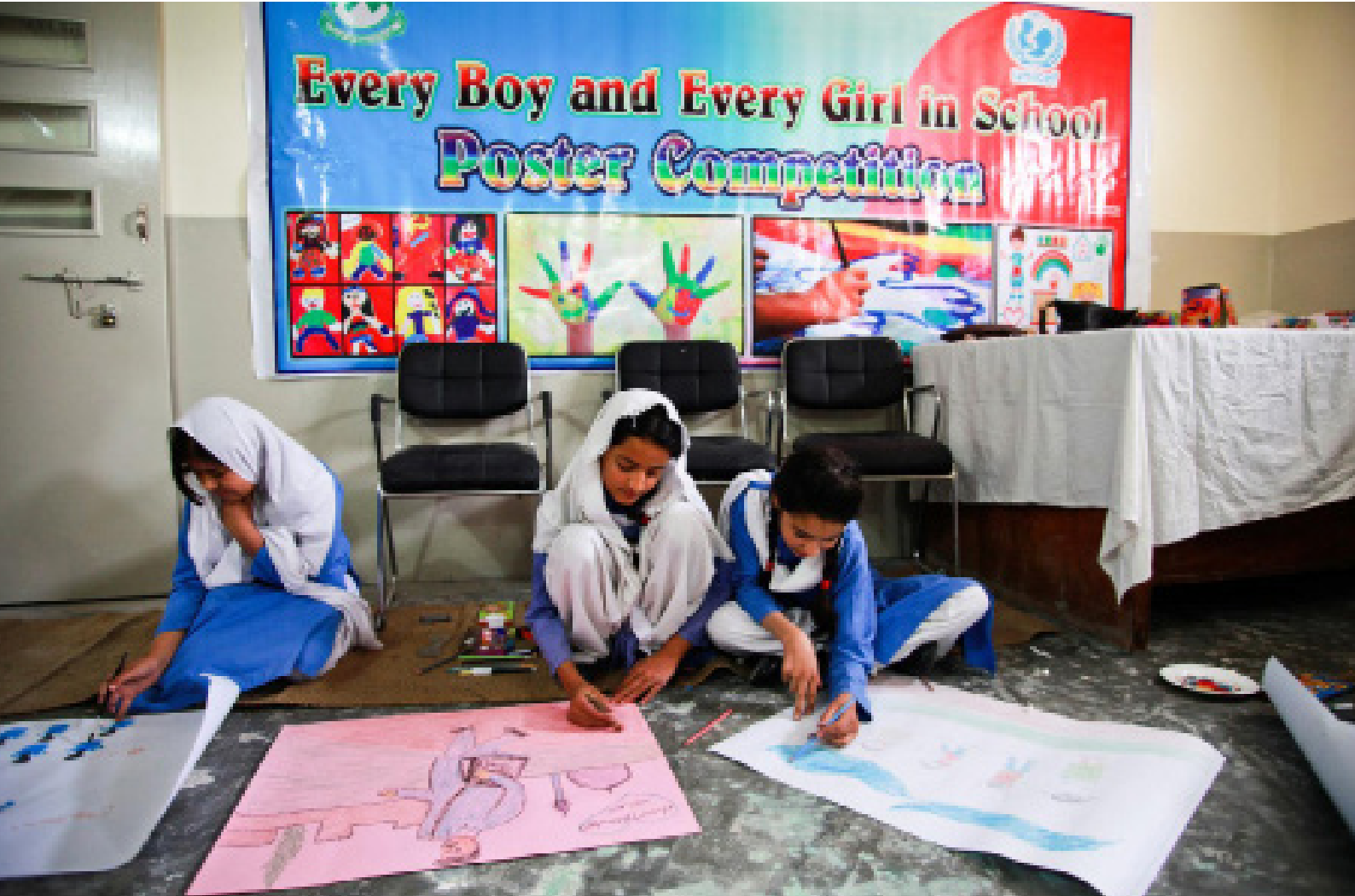
Young girls participate in a drawing competition during a school enrollment campaign in Killa Kanci, Quetta City, Balochistan Province.