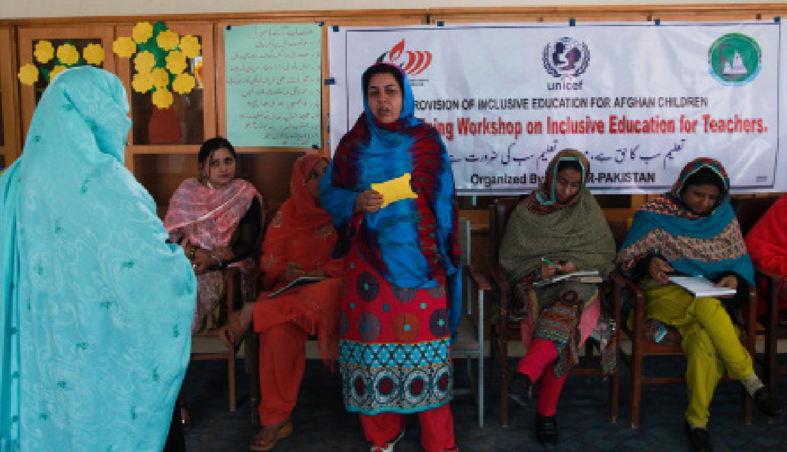
Government school teachers attend a four day training workshop on inclusive education for teachers in a government school in Quetta City, Balochistan Province.